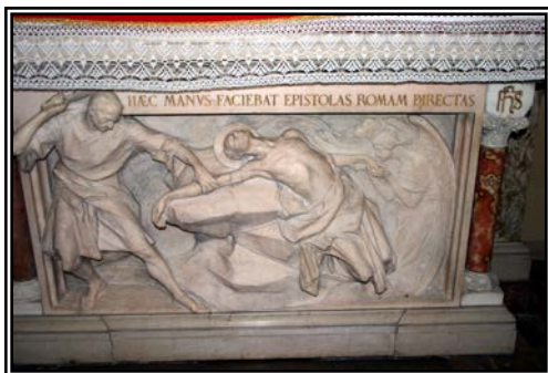
This marble relief shows the murder of Arialdo da Carimate a patarino ; the Relief is from a "Medieval revival" chapel in the Church San Calimero in Milan

The Milan inferior classes (workers and farmers) supported the honest men, Anselmo, Landolfo, Arialdo, and Attone as reform leaders against the newly installed Archbishop Guido, the noble families of Milan, and the Empire. The reform members met for meetings in the second-hand dealers or “rag pickers” quarter of Milan, thus becoming known as the pataria (la contrada dei patari ). In 1056, Anselmo, a zealous and eloquent young priest who was a leader of the reform movement, was appointed Bishop of Lucca. In 1057, the pataria supported Arialdo in the “liturgico strike” or “ sciopero liturgico ”, which boycotted religious functions of priests who were involved in concubinage, marriage, and corruption. The Church, which considered these strikes as heresy, decided at the time to not question the theological motivations of the strike and to support the patarini . At the Lateran Council of 1059, the Church passed severe laws against simony and marriage. The laws threatened all priests who were unwilling to give up their wives or concubines with the loss of their benefices and reading church mass.